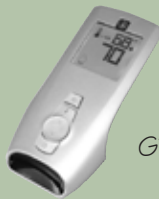
GTM Smart Remote