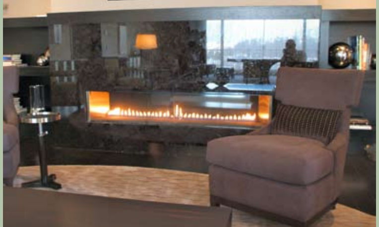
Shown with Clean Face