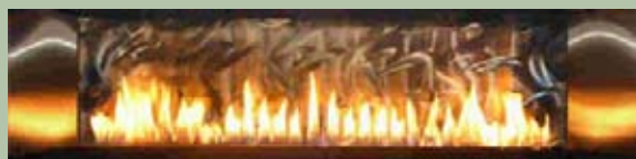
Stainless Steel – Pearled