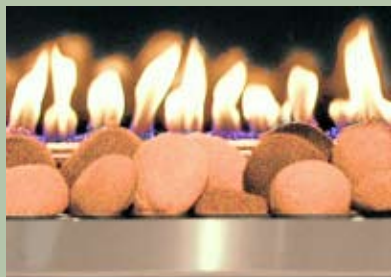
Shown with River Rock

Available: River Rock, Clear Glass Stones